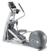
556i ELLIPTICAL CROSS TRAINER