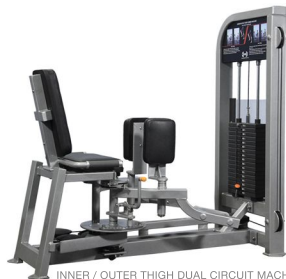
INNER / OUTER THIGH DUAL CIRCUIT MACHINE