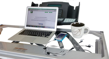
TREADMILL DESK WORKSTATION