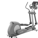
9500HR ELLIPTICAL CROSS TRAINER